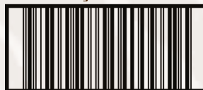
Tobalá: Case of Six